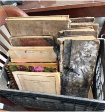
Box of books from John Remmer

We were almost finished with the last box of SSSC documents until John Remmer dropped off a box someone found stored in their garage. The box consisted of 5 or 6 SSSC books in terrible condition and are in desperate need of repair; one photo album from about the 1920's; and a stack of SSSC Treasurer's Reports, also from the 1920's. All of these will be documented.